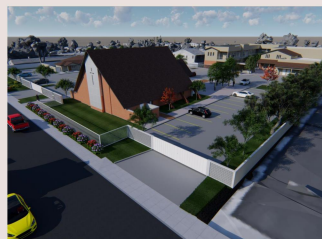
4. New secondary parking lot entrance