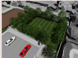
3. New playground for teenagers