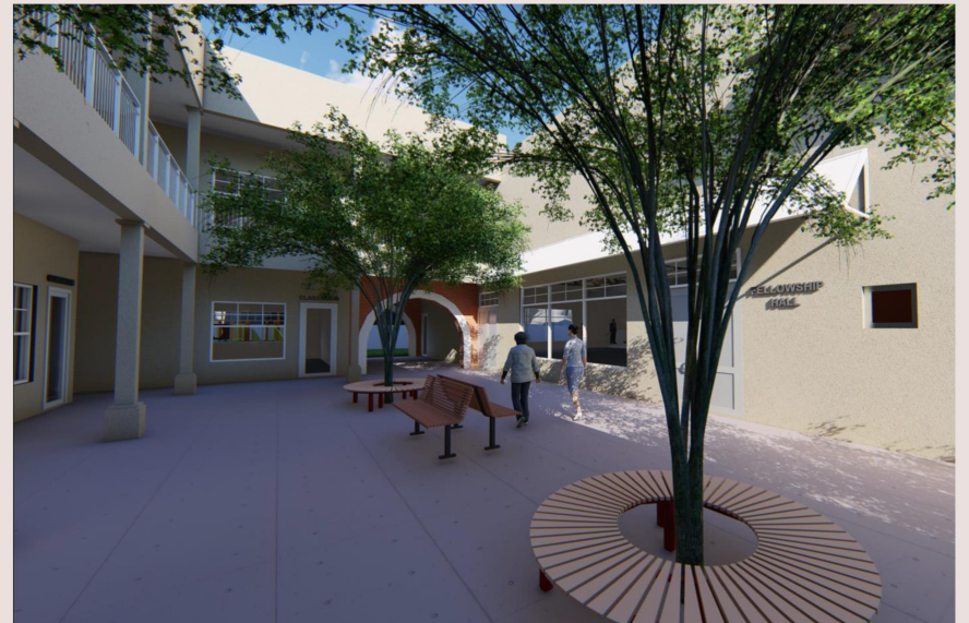
Courtyard View – Education Building (Right) & Fellowship Hall (Left)