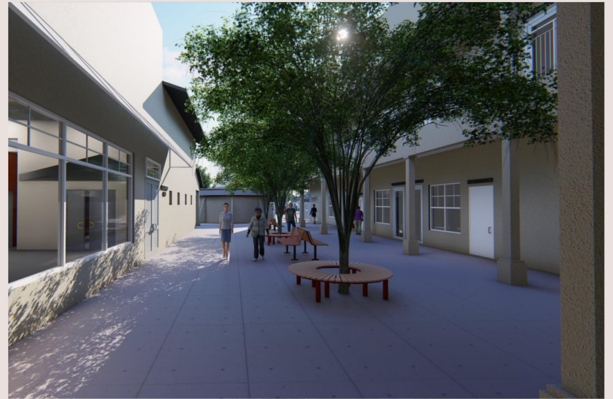
Courtyard View – Education Building (Right) & Fellowship Hall (Left)