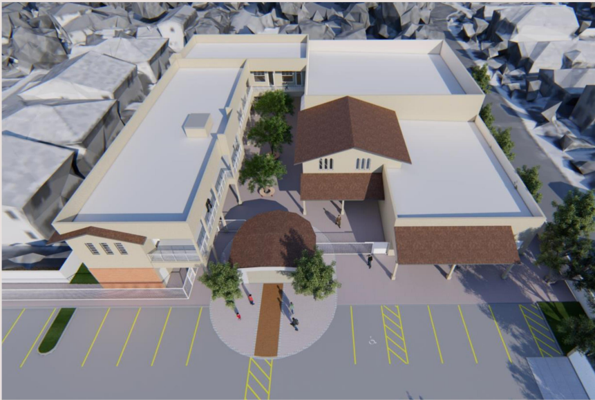
New Education Building (Left) & Fellowship Hall (Right)