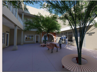
1. New Fellowship hall / Educational Facility

Please note that, following the completion of the new construction, the existing office, classrooms, and fellowship hall will be removed.