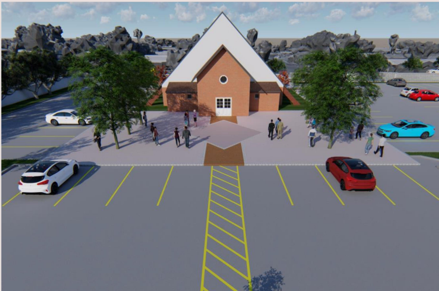
Holy Family Plaza